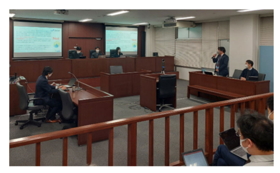
Figure 2. Mock trial in the courtroom at Meiji University

The aim of this mock civil trial (Figure 2) was to examine, using a hypothetical crash scenario caused by a car with the Level 2 automated driving system, if the legal liability of the manufacturer for inappropriate or inadequate system design and that of the dealer for inappropriate or insufficient explanation about the system would be recognized when the limitations of human capabilities for safe use of the system were publicly known.