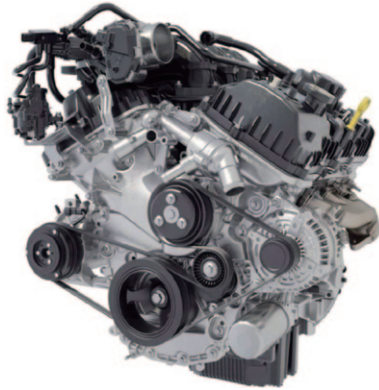
Fig. 7 Ford 99B

tang GT in autumn, were launched. All of them represent Ford's first use of a fuel system with both direct and port fuel injection, and feature improved output and thermal efficiency (1) . Among engines not yet available, a technical paper was published on the second-generation EcoBoost 1.0-liter engine announced as the world's first 3-cylinder engine equipped with a cylinder deactivation system (scheduled for installation in the new hatchback Focus in 2018). The paper revealed that cylinder deactivation provide a 40 g/kWh decrease in fuel consumption in the 1,500 to 3,000 rpm light load range compared to the first generation model under the same operating conditions, and that the cooling system had been extensively modified to reduce fuel consumption (6) . A newly developed dual-mass flywheel and clutch disc reduce vibrations to solve the issue of NVH caused by engine speed 0.5th-order vibrations generated by uneven combustion intervals (7) . The installation of a newly developed 1.5-liter 3-cylinder EcoBoost engine equipped with the same cylinder deactivation in the Fiesta ST planned for release in 2018 was announced in February. That same engine is also scheduled to be installed in the new Focus hatchback to be launched in 2018 (1) .