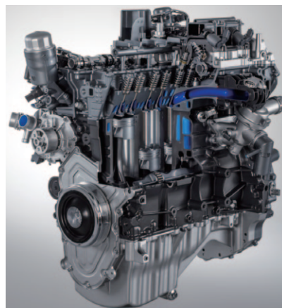
Fig. 12 Jaguar AJ20-P4

The newly developed Ingenium family 2.0-liter 4-cylinder turbocharged AJ20-P4 (Fig. 12), installed in the XE sports saloon and other models, was launched in May. It shares a modular design with the Ingenium 4-cylinder diesel engines launched in 2015 and 2016, with many common specifications and parts, including the bore diameter, stroke, and deck height, as well as the crankshaft main journal diameter, balancer position, gears, and the oil pan. The engine comes in two different hardware configurations, the mid and high specifications, with the mid specification further offering two output variations, for a total of three variations covering an output range of 147 to 221 kW. Both the mid and high specifications include high tumble combustion, the Miller cycle, an exhaust manifold integrated in the cylinder head, stepless intake variable valve lift, sodium filled valves, coolant stoppage during warm-up, full variable oil and water pumps, and twin-scroll turbochargers, with the high specification adopting a ceramic roller bearing turbocharger. The engines comply with the emissions regulations of various countries and have reduced fuel consumption (1)(2) .