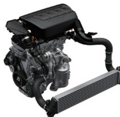
Fig.6 SUZUKI K14C

The upgraded SKYACTIV-G 2.5-liter 4-cylinder PY-RPS engine, installed in the North American CX-5 crossover, was launched in December. It includes new technologies such as a cylinder deactivation system that relies on a switchable hydraulic lash adjuster (S-HLA), a variable displacement oil pump, and a coolant control valve to improve fuel efficiency in the lighter load range and during warm-up. In the S-HLA, the tip of the lash adjuster is designed to move up and down when pressure releases the internal lock pin, at which time the roller rocker is pushed toward the S-HLA rather than the valve, with the up-down movement stopping the opening and closing of the valve and deactivating the cylinder (5) . In August, announced the introduction of the SKYACTIV-X (Fig. 5) featuring Mazda's proprietary, world-first Spark Controlled Compression Ignition (SPCCI) combustion method. The SPCCI method creates an expanding flame kernel at the spark plug in a compressed lean air-fuel mixture, further compressing the air-fuel mixture which triggers multiple simultaneous self-ignition. This