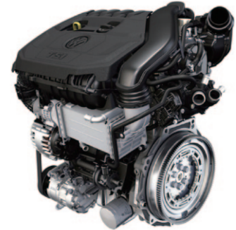
Fig. 10 VW EA211 TSI evo

delta cylinder heads, and the application of bore spray coating (BSC) and NANOSLIDE (a mirror finish) to the cylinder bores, along with the first use of cylinder deactivation via CAMTRONIC in a 4-cylinder engine by Mercedes-Benz, make this engine stand out. At Mercedes-Benz, it replaces the 1.6-liter 4-cylinder turbocharged M270 engine.