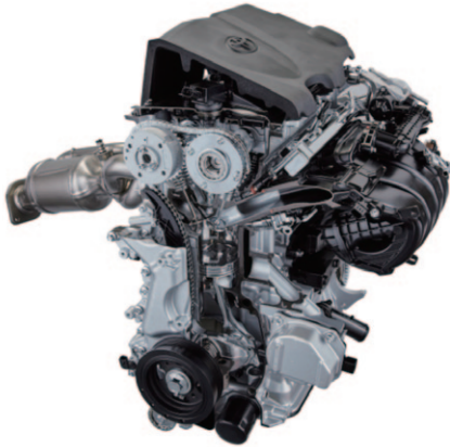
Fig.1 TOYOTA A25A-FKS

*3: S-DI and C-DI represent, respectively, side and center layout direct injection, and the figure in parentheses indicates the direct injection maximum fuel pressure.