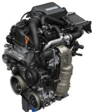
Fig. 4 HONDA S07B Turbocharged