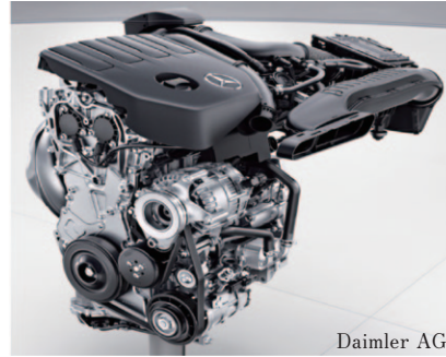
Fig. 9 Daimler M282