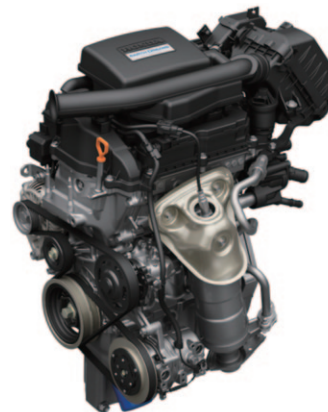
Fig. 3 HONDA S07B NA