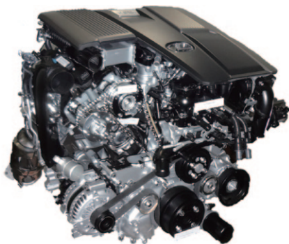
Fig. 2 TOYOTA V35A-FTS

features a newly developed in-house compact high efficiency turbocharger, laser-clad valve seats and piston exhaust cooling by multi-point oil jets to achieve a maximum output of 310 kW, a maximum torque of 600 Nm, and a maximum thermal efficiency of 37% (1)(3) .